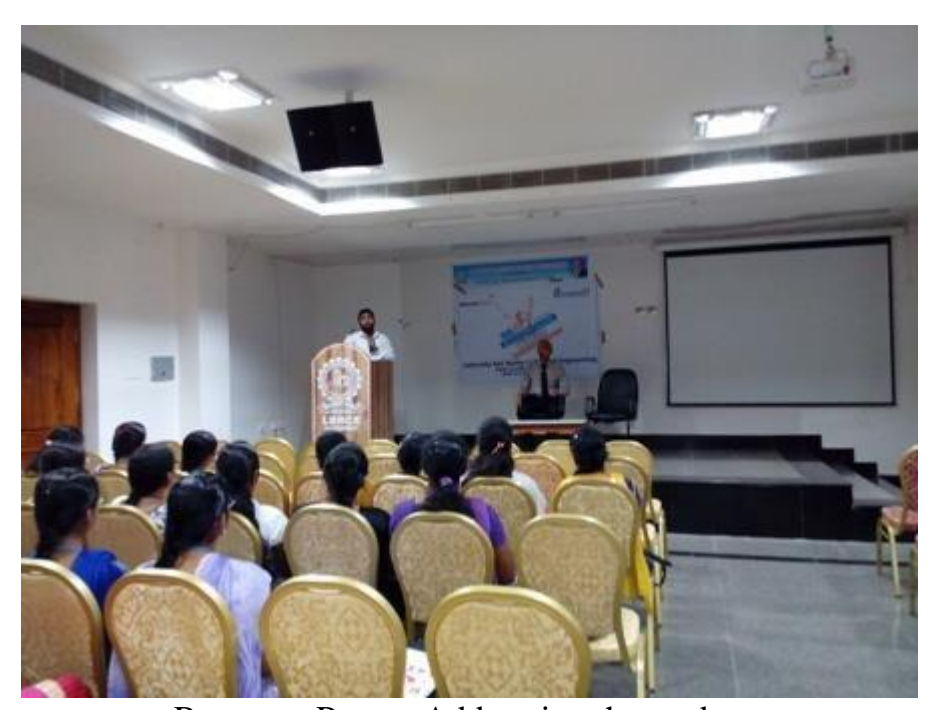
Resource Person Addressing the students